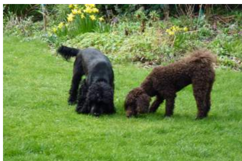
Bella and Rocko relax after grooming session.